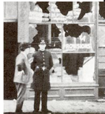
Anti-Asian Riot, 1907

4:30 ~ Art + Political Engagement: Case studies from Java, Philippines, and Coast Salish territory of artists producing 'art for protest sake.' Location: Kalayaan Centre, 451 Powell St. followed by 6-8pm dinner & social.